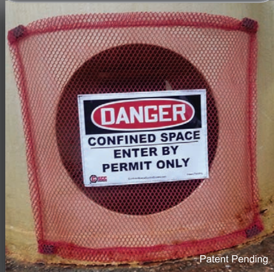
MAGNETIC MESH COVER ITEM # MAGRM