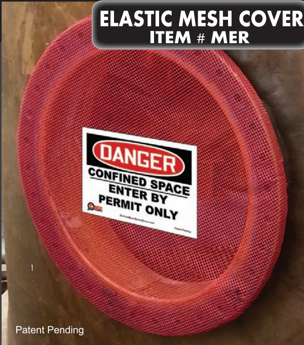
ELASTIC MESH COVER ITEM # MER